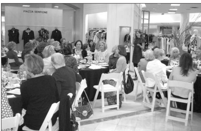
Members of Great Falls Woman's Club enjoyed a fabulous Spring High Tea and Fashion Show at Saks Fifth Avenue in Tysons.

Thomas Designs and Construction, Inc. Quality Renovations and Improvements